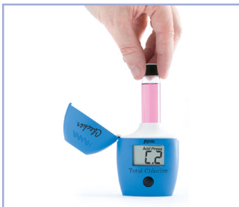
3. Insert sample