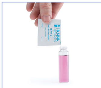
2. Add reagent