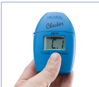
1. Zero the Checker