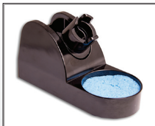
Safety Stand ST6A