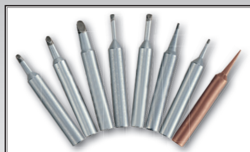
Replacement Bits - XS series