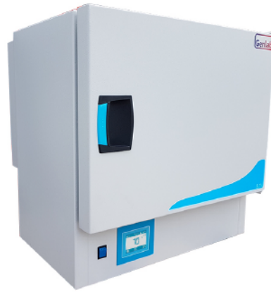
Model Shown - MINI/50/TDIG/F

The Genlab range of Benchtop Incubators offers a selection of highly efficient, reliable and cost effective incubators to suit most biological analysis, research and general laboratory applications. Available in a variety of sizes and designed with both side or base mounted displays to suit your exact needs. They feature our latest touch screen control system which offers intuitive control and excellent accuracies designed for laboratory incubators.