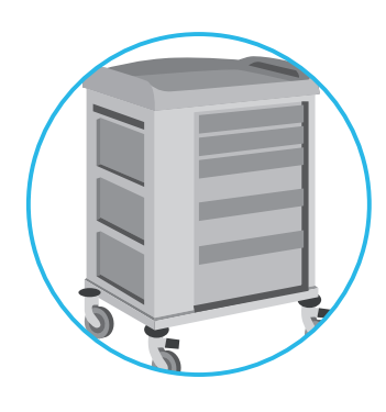
TROLLEYS (I.E. SMALL EQUIPMENT & RESUSCITATION)