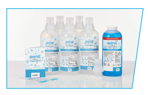
1 LITRE DISTEL DOSING SYSTEM STARTER PACK CCH050101

1x1Litre Bottle of Concentrate - 5x1Litre Dosing Bottles 6x5ml Dosing Heads -1x Working Solution Bottle Label