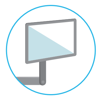
WORKSTATIONS (MONITORS & KEYBOARDS)

THE DISTEL DOSING SYSTEM IS INTENDED FOR THE CLEANING AND DISINFECTION OF SURFACES OF NON-INVASIVE MEDICAL DEVICES AND EQUIPMENT, AND OF HARD NON-POROUS ENVIRONMENTAL SURFACES SUCH AS: