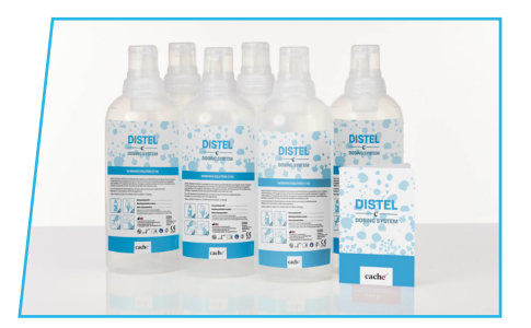
1LITRE DISTEL DOSING SYSTEM DOSING BOTTLES CCH050301

1x1Litre Bottle of Concentrate -1x5ml Dosing Head 1x Working Solution Bottle Label