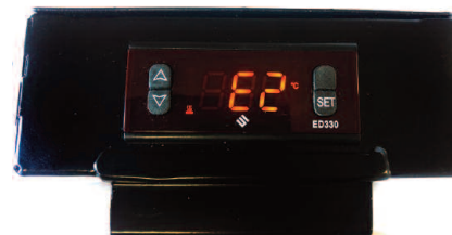
The Irwin waterbath head unit showing the maximum temperature limit setting.

The hidden menu may be accessed by pressing and holding the SET button down for 10 seconds. The LED display will show E1. Briefly press SET and toggle through the menu options using the up/down keys to change settings. Once you have made changes, leave the unit for about 6 seconds to exit to the menu to resume normal operation.