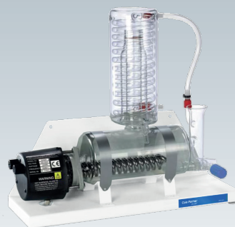
Water Still WS-100