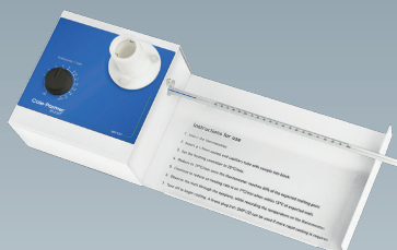
Melting Point MP-100