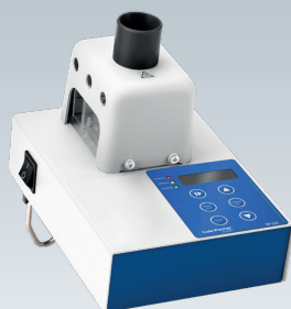
Melting Point MP-200