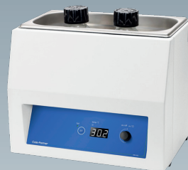
Digital Water Bath WB-300